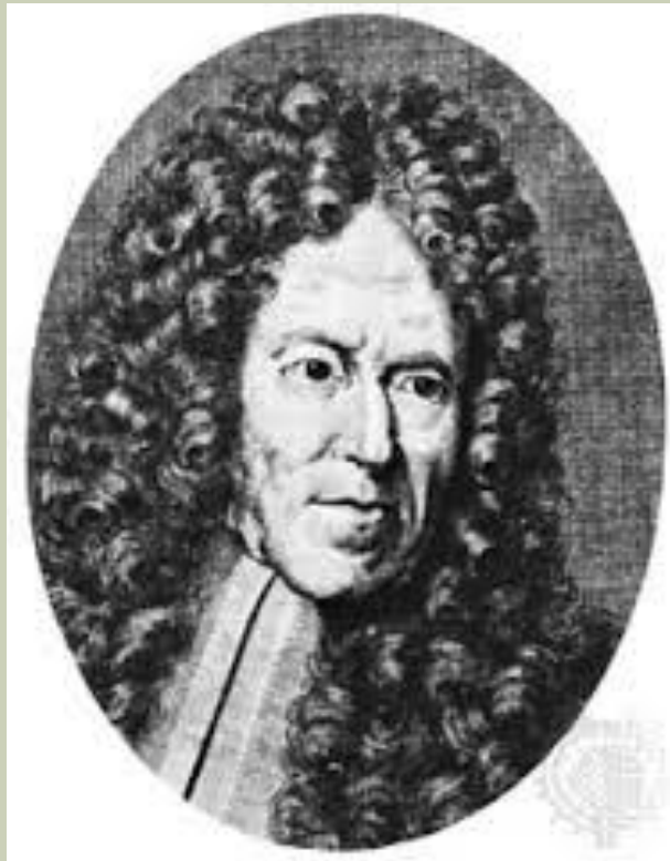
RAMAZZINI (1633 - 1714)